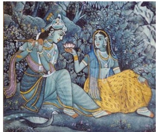
Krishna and Radha are one of the greatest loves stories of all time

One of the greatest love stories of all time is the Hindu legend of Radha and Krishna. Krishna, the incarnation of Lord Vishnu, grew up in the small cow-herding village of Vrindavan and fell in love with a gopi , or milk maid named Radha. According to ancient mythology, among the thousands of gopis , 108 are prominent and of them, eight are principal. Among the eight, Radha and Chandravali are the most important and of the two, Radha is superior. Legend states that since their childhood, Radha and Krishna were very close – they played, danced, fought, grew up together and wanted to be together forever. However, fate pulled them apart.