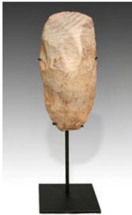
Example of a fully knapped tool from PRIMITIVE's collection in Chicago

The earliest stone tools in the life span of the genus “Homo” are Mode 1 tools, which come from the Olduvai Industry in Africa, mentioned above. In these tools only one end was shaped. The earliest known Olduvai tools date from 2.6 million years ago. Eventually, more complex, Mode 2 tools began to be developed through the Acheulean Industry. These tools appear to be hand axes and knives, are fully knapped, and characterized as “biface,” the sharpest point running around the length of the object. Mode 2 objects first appeared in the archeological record as early as 1.7 million years ago in the West Turkana area of Kenya in East Africa, but it is clear that this “technology” spread westward, as stone tools have been excavated as far west as the Sahara in Mali, West Africa.