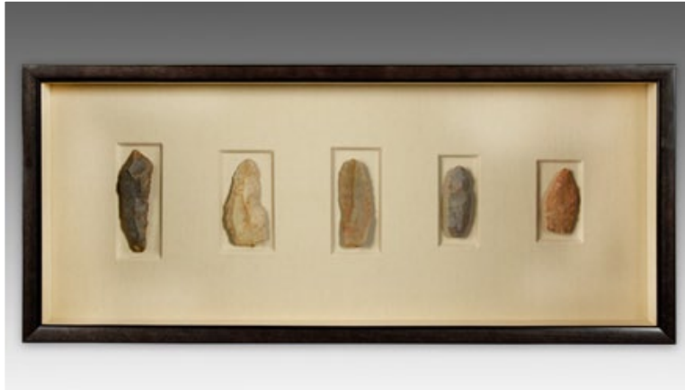
Single based knapped blades as well as framed collections of prehistoric knapped tools are available at PRIMITIVE

to great arguments in the archeological community, although there is no debate that Homo Habilis and Homo Erectus co-existed at the same time. Whether the tools in PRIMITIVE's collection come from man's earliest or next to earliest ancestors is immaterial, for there is no debate they provide real evidence of humankind's ingenuity, resourcefulness, and will to survive.