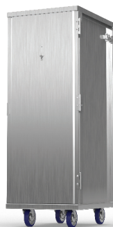
MODEL EC1832-C-PP Holds 32 Trays