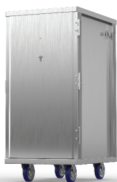
MODEL EC1824-C-PP Holds 24 Trays