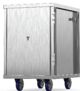
MODEL EC1816-C-PP Holds 16 Trays