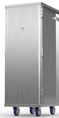
MODEL EC1840-C-PP Holds 40 Trays