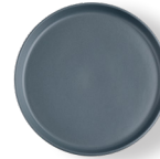
FP272 Gourmet Plate (7 7/8") 1 Dz.