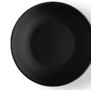
FP237 Side Plate (7 1/2") 1 Dz.