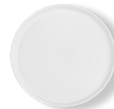
FP287 Gourmet Plate (11 1/4") 1 Dz.