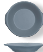
FP266 Saucepan w/ Handles T: 8 1/2" M: 9" H: 1 1/2" 6 Pcs.