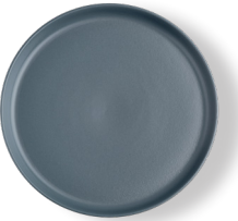
FP288 Gourmet Plate (11 1/4") 1 Dz. Available Q3