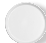
FP259 Gourmet Plate (7 7/8") 1 Dz.