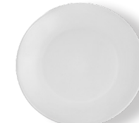
FP248 Dinner Plate (11") 1 Dz.