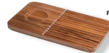
FP318 Wood Soup/Salad/Sandwich Board 14" x 8" 6 Pcs. SKUS that fit inner circle: FP242 FP255 FP268 FP239 FP252 FP265 FP241 FP254 FP267