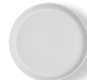
FP258 Gourmet Plate (9 1/2") 1 Dz.