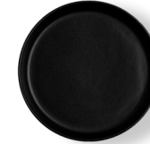
FP245 Gourmet Plate (9 1/2") 1 Dz.