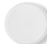
FP257 Gourmet Plate (10 1/8") 1 Dz.