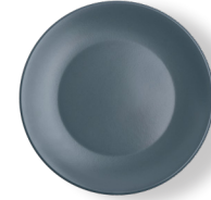
FP261 Dinner Plate (11") 1 Dz.