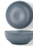
FP265 Round Bowl D: 5 7/8" H: 2 1/2" (17 Oz.) 2 Dz.