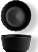
FP241 Flair Bowl D: 4 7/8" H: 2 3/8" (13 Oz.) 6 Pcs.