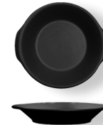
FP240 Saucepan w/ Handles T: 8 1/2" M: 9" H: 1 1/2" 6 Pcs.