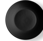
FP236 Salad/Dessert Plate (9") 1 Dz.