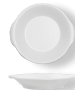
FP253 Saucepan w/ Handles T: 8 1/2" M: 9" H: 1 1/2" 6 Pcs.