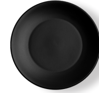
FP235 Dinner Plate (11") 1 Dz.