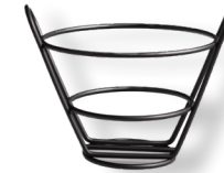
FP316 French Fry Holder Black PVD H: 4" L: 4 \frac{1}{2} " W: 5 \frac{1}{4} " 4 Dz.