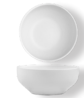
FP252 Round Bowl D: 5 7/8" H: 2 1/2" (17 Oz.) 2 Dz.