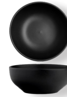
FP239 Round Bowl D: 5 7/8" H: 2 1/2" (17 Oz.) 2 Dz.