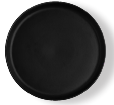
FP286 Gourmet Plate (11 1/4") 1 Dz. Available Q3