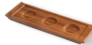
FP317 Wood Tray 3 Double Wells 14 \frac{1}{2} " x 4 \frac{3}{4} " 6 Pcs. SKUS that fit inner circle: FP316 FP243 FP256 FP269 FP315