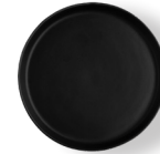
FP246 Gourmet Plate (7 7/8") 1 Dz.