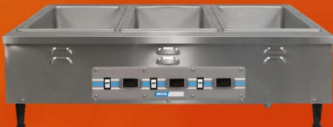
Countertop Food Warmers

Wet or Dry Food wells Available with 2-6 wells