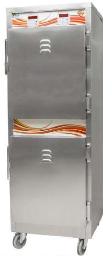
Super Holding Cabinets

Powder Coated frame for superior corrosion resistance