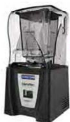
Connoisseur 825 Pkgs

C825C11Q-B1GB1A Includes (2) 75 oz FourSide™ jars C825C11Q-B1GB1D Includes (2) 90 oz WildSide™ jars