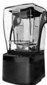
Stealth 885 Pkgs World's Quietest Commercial Blender

C825C11Q-B1GB1A Includes (2) 75 oz FourSide™ jars C825C11Q-B1GB1D Includes (2) 90 oz WildSide™ jars