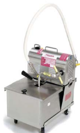
ECCO ONE P