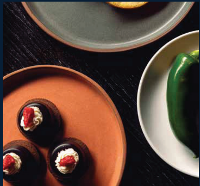
Maria Portugal Terracota Collection