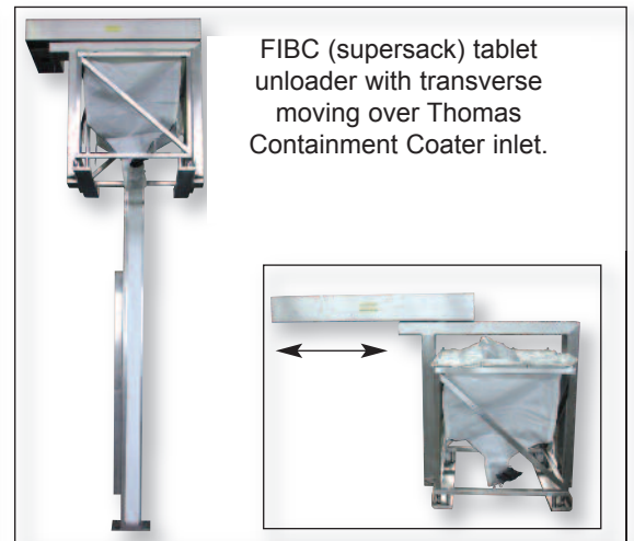
FIBC (supersack) tablet unloader with transverse moving over Thomas Containment Coater inlet.