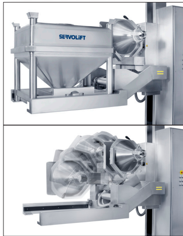
Combination Bin & Drum Lifter