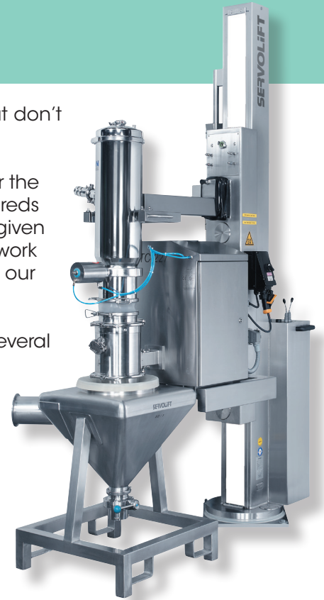
Vacuum Receiver & Milling System to Bin

So what's possible? We say: "if it conforms to physics, we can do it".