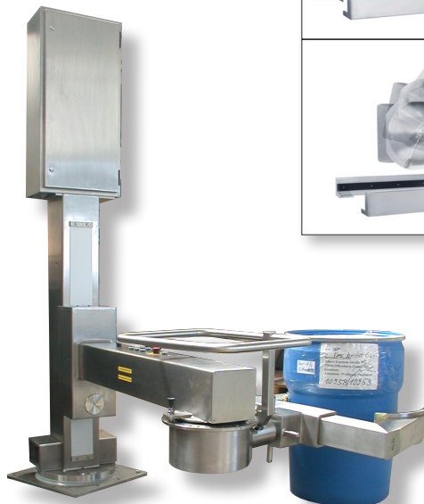
Weigh Room Drum Manipulator