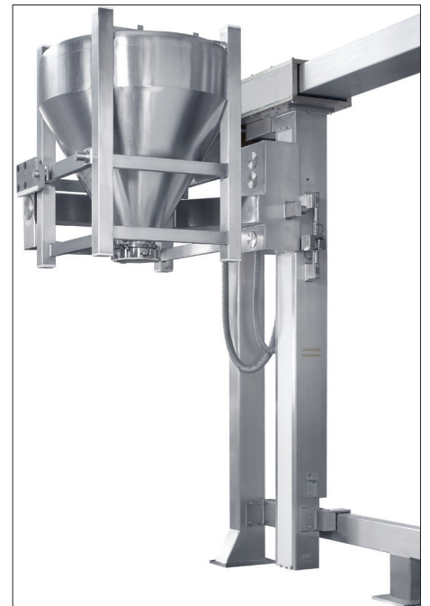
Space Saving Bin Lift with transverse moving & High Containment Docking to tablet press.