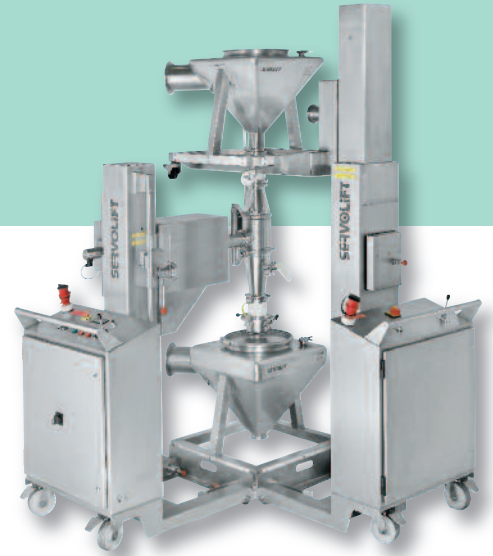
Mobile Tablet Coater Loader with Battery powered drive. Designed for every coater make & model.