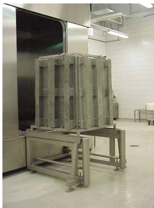
Wash Drums, Bins & Pallets