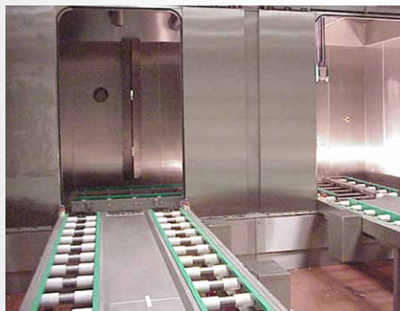
Automatic Loading Systems