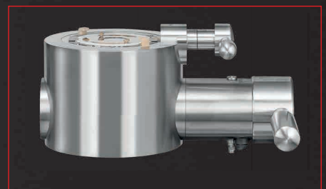
APORT interface closed