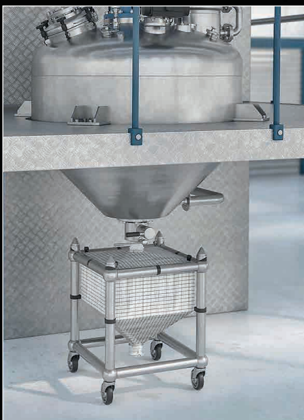
Emptying out of vacuum dryer via APORT into ACUBE packaging unit

APORT is the worldwide first and the only valve which meets all these requirements.