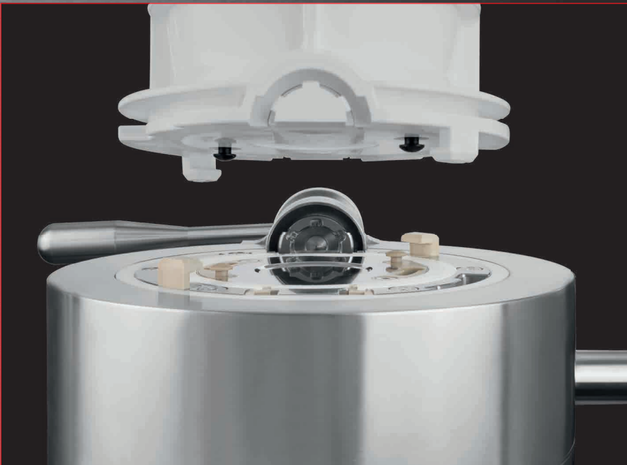
Starting situation of charging process