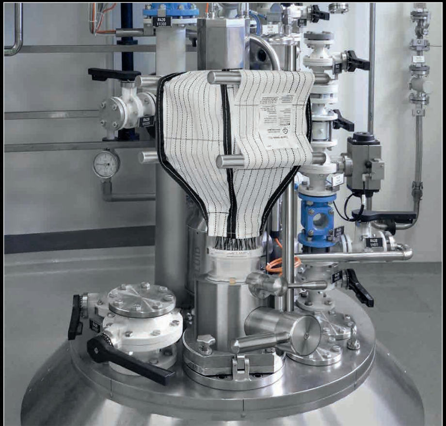
Single-use reactor charging with vacuum & pressure resistant APORT

The APORT is used in applications that include process vessels with explosive atmospheres such as reactors, blenders and dryers with high demands for containment, vacuum and pressure shock resistance.