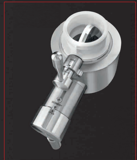
APORT locked and open