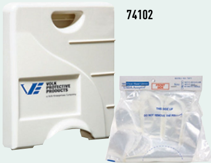
74102 Cream polypropylene dispenser, 8" x 9", 20 each per case

Single-use gloves and proper handwashing go hand-in-hand. Before handling any food, wash hands thoroughly and put on clean gloves. Remove and discard gloves after handling raw food. Wash hands again and put on clean gloves before handling ready-to-eat food.