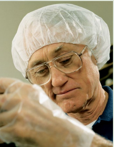
Hairnets White nylon hairnet.