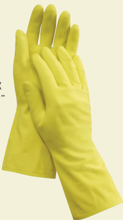
Yellow Latex Gloves Yellow flock-lined latex with embossed grip, 12"