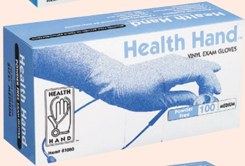
Health Hand® Vinyl*