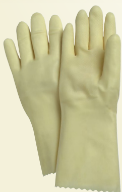
Natural Latex Gloves Latex with embossed grip, 12"