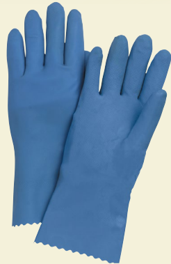
Blue Latex Gloves Latex with embossed grip, 12"