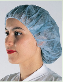
Blue Bouffants • Latex-free elastic headband for secure and comfortable fit. • Component materials comply with FDA regulations for food contact. • Polypropylene spunbonded.