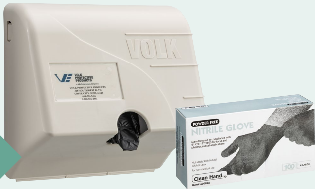
71102 Cream polypropylene dispenser, 10 each per case