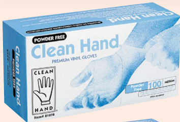
Clean Hand® Vinyl