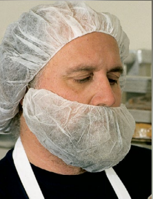
White Bouffants Spunbonded bouffant head cover.