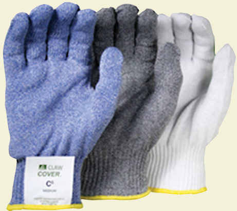
ClawCover Glove High-performance synthetic fiber and steel, ANSI level 6