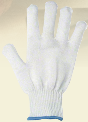
Volk Cut & Safe Glove Value priced Spectra® knit. Launderable and bleachable, ANSI level 4