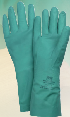
Nitrile Gloves Green unlined, embossed grip, 13" or 19"