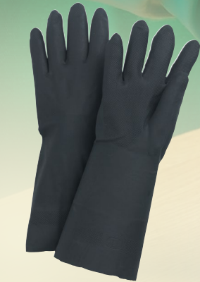
Neoprene Gloves Black flock lined neoprene with embossed grip. Case pack: 12 doz. pair in individual poly bags.