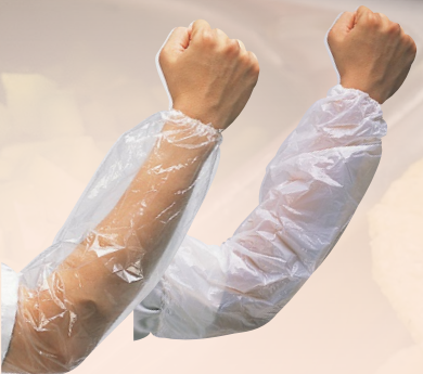
Clean Hand® Poly Sleeves Clear, disposable sleeves, embossed polyethylene sleeves, with elastic ends, 1 mil., 18" length

Used primarily in foodservice, Clean Hand® polyethylene disposable gloves are very cost effective. Volk Protective Products offers the widest selection of bulk packaging to help make the value that much greater for you. Our polyethylene gloves are hot-seamed flat and are manufactured from materials to comply with FDA requirements for food contact. Recommended for short-term use, these ambidextrous barrier solutions can be dispensed economically throughout any facility. Volk Protective Products' poly line includes wrist length poly, elbow length poly, and poly sleeves.